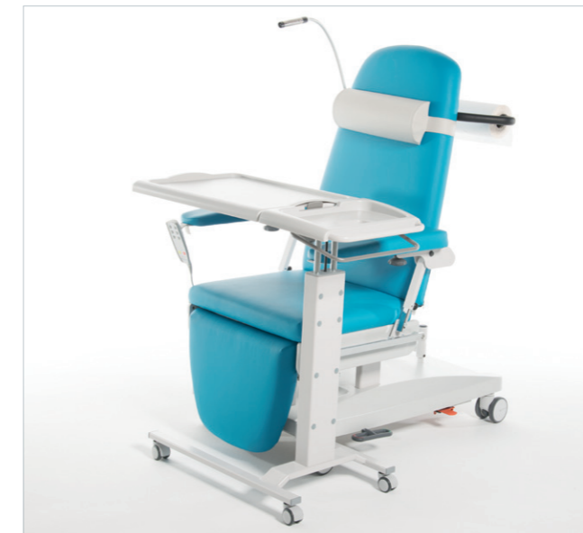
Perfect for combining with the MULTILINE NEXT DC and IT (IT shown here)